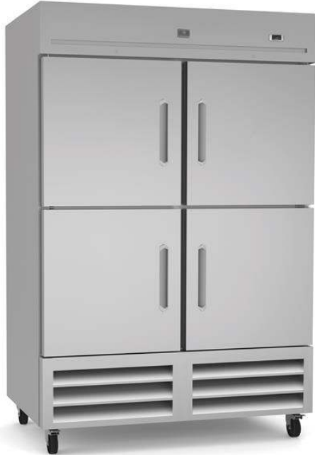
738282 (KCHRI54R4HDR) 4-Half Door Full Height Refrigerator 54" Long